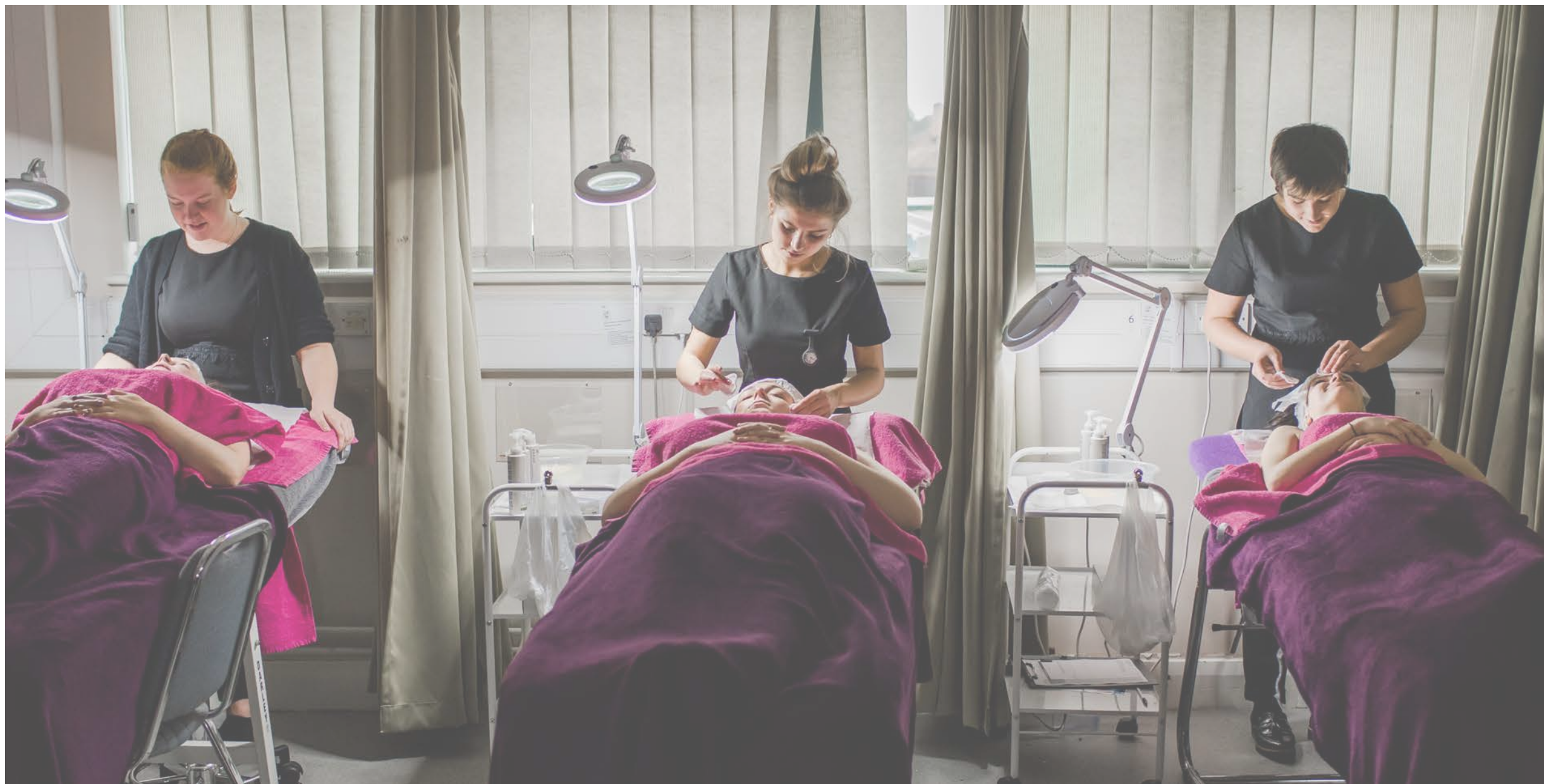
Envy Hair and Beauty, South Gloucestershire and Stroud College, Filton Ave, Bristol, BS34 7AT